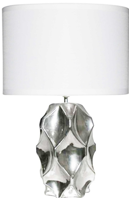
1 Light Incandescent Table Lamp Polished Chrome Finish with White Shade