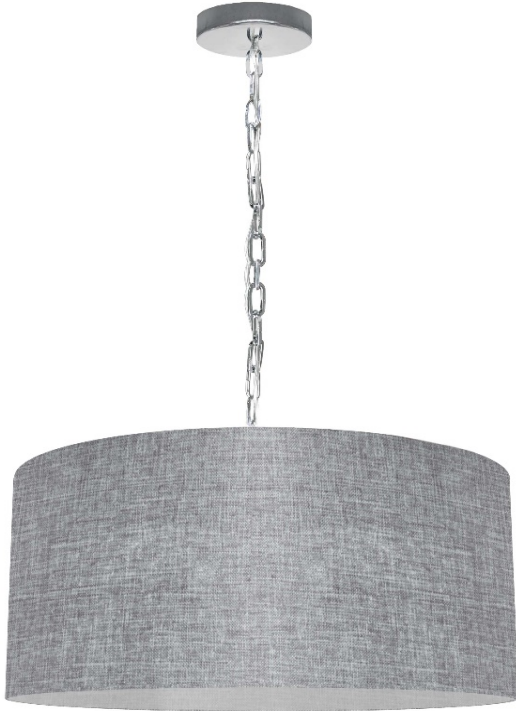
1 Light Medium Braxton Polished Chrome Pendant w/ Grey/Clear Shade