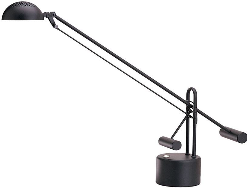
8W LED Desk Lamp, Black Finish