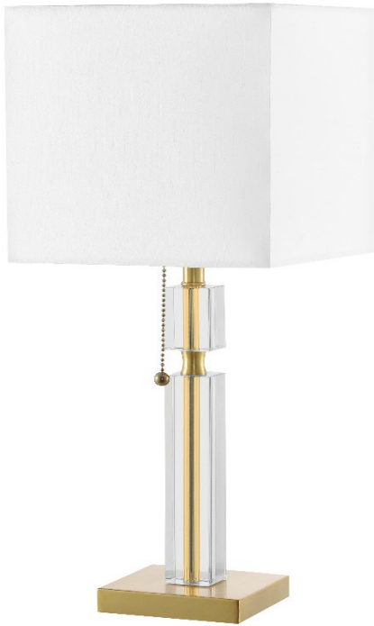
1 Light Incandescent Table Lamp Aged Brass with White Shade