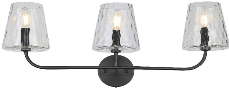
3 Light Incandescent Vanity Matte Black with Clear Hammered Glass