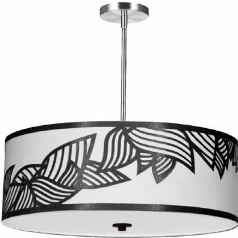
4 Light Pendant Polished Chrome Black and White Shade